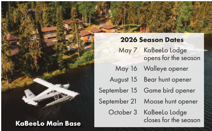
KaBeelo Main Base