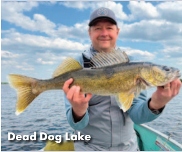
Dead Dog Lake